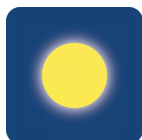
Amber when ON

Thanks to cutting edge interference and absorber coating