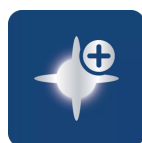
Up to 5,000 K

For fatigue-free and comfortable driving compared to standard halogen lamps