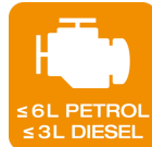
≤ 6L PETROL ≤ 3L DIESEL

New Boost function allows user to restart vehicles with depleted batteries