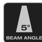
Beam angle 5° Exceptionally focused beam angle