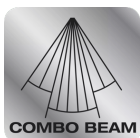
Combo Beam Combined beam of light