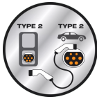
Type 2 to Type 2

Charge at home and on the move Type 2 to Type 2 PIN | 3PHASE