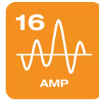
Connects to any 16A (3 phase) charging unit or station with a type 2 connection.

Charge at home and on the move Type 2 to Type 2 PIN | 3PHASE