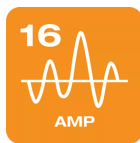
Connects to any 16A (3 phase) charging unit or station with a type 2 connection.

Charge at home and on the move Type 2 to Type 2 PIN | 3PHASE