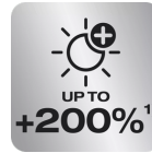
Up to 200% more brightness 1)

Quick and uncomplicated modification and installation