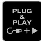
- Plug & Play

Fully dynamic LED mirror indicator with high-performance LEDs