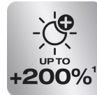
Up to 200% more brightness 1)

Quick and uncomplicated modification and installation