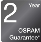
2 Year OSRAM Guarantee*

Three light functions - high with up to 500 lm, low with up to 250 lm and torchlight function with up to 70 lm