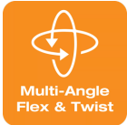
Multi-Angle Flex & Twist