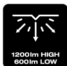
Up to 1200lm (high) & 600lm (low)

Up to 4.5h operating time. Rechargeable via USB-C port with a charging time of only approx. 3 hours