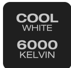
6000K & Cool White

The NIGHT BREAKER LED family - OSRAM's first street-legal1) LED retrofit lamps.