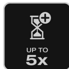
Up to 5 times longer lifetime3)

See and be seen with OSRAM. Cool white color temperature similar to daylight. For more safety on the road, especially when driving at night