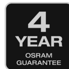
4 year OSRAM guarantee

Vibration resistant, environmentally friendly, and cost-efficient