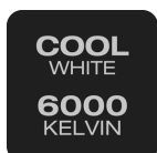
6000K & Cool White

The NIGHT BREAKER LED family - OSRAM's first street-legal1) LED retrofit lamps.